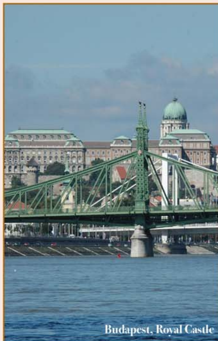
Budapest, Royal Castle