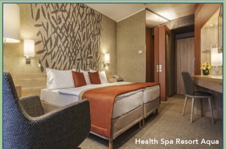
Health Spa Resort Aqua