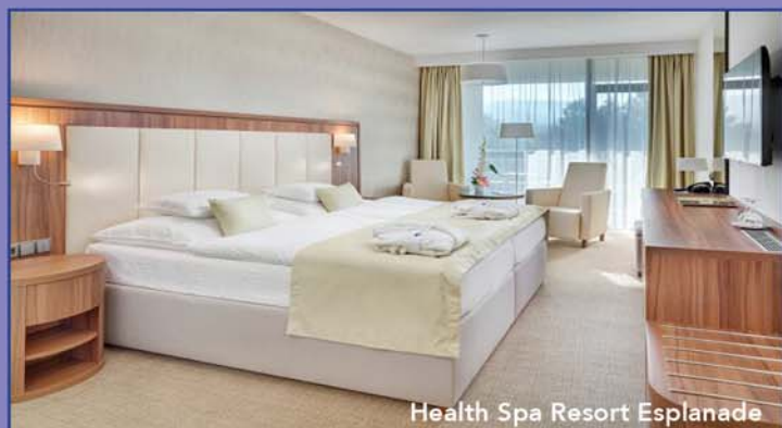
Health Spa Resort Esplanade

1, 2 & 3 week Traditional Spa Therapy Packages January 13, 2020 - January 12, 2021