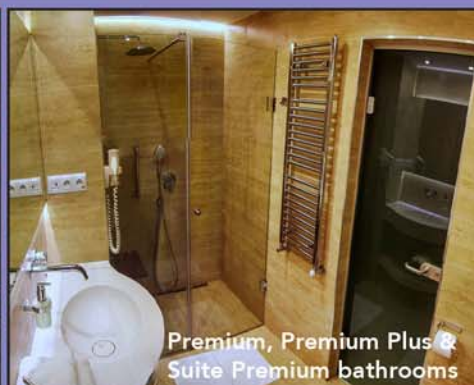
Premium, Premium Plus & Suite Premium bathrooms