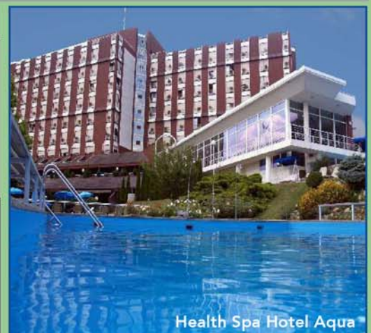
Health Spa Hotel Aqua

The temperature of the lake is 92°-96° Fahrenheit in the summer and 80° Fahrenheit in the winter. Guests can use the waters of the lake all year round - indoors or outdoors. A cloud of fine vapor over the lake is a special sight to see. The high degree of evaporation not only makes open air bathing more pleasant on the coldest winter days, but also positively influences the climate around the lake.