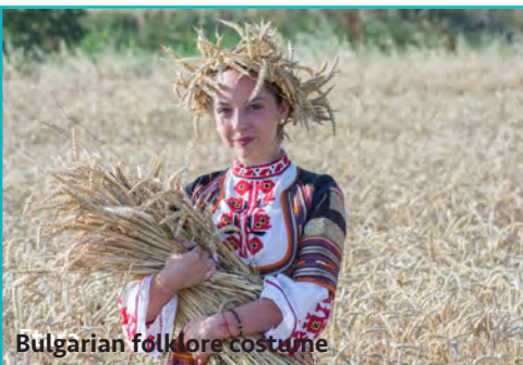
Bulgarian folk costume