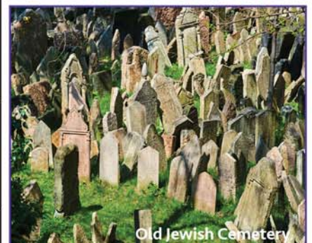
Old Jewish Cemetery