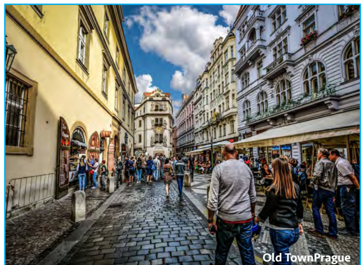
Old Town Prague