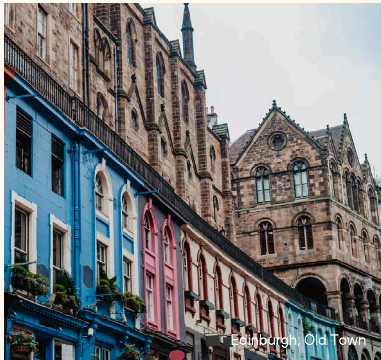
Edinburgh Old Town