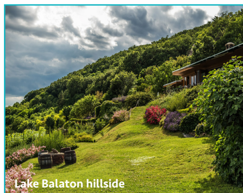
Lake Balaton hillside