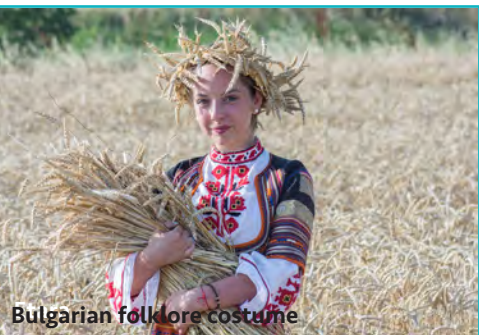
Bulgarian folk costume