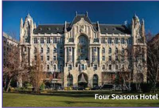
Four Seasons Hotel